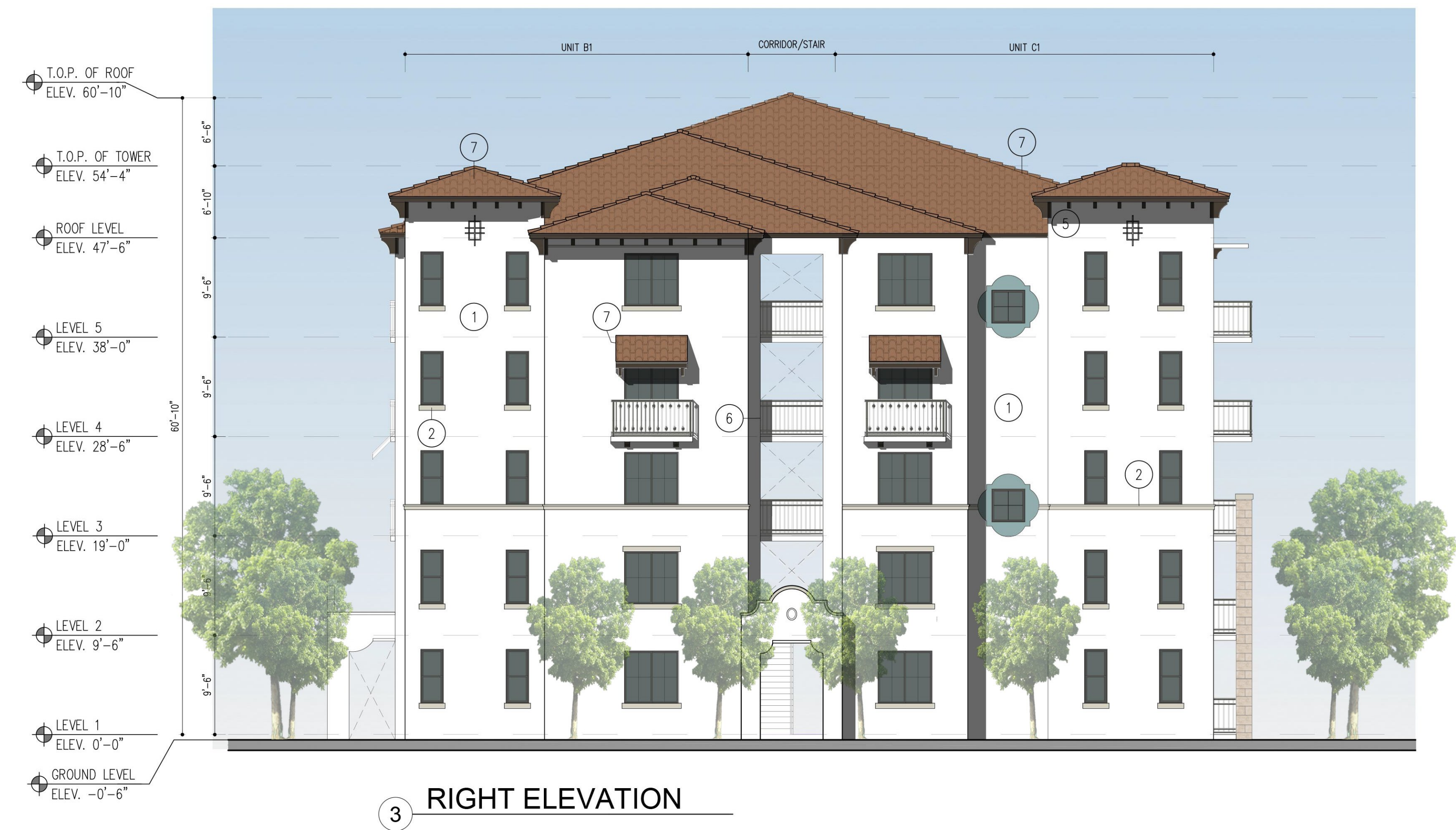
3 RIGHT ELEVATION